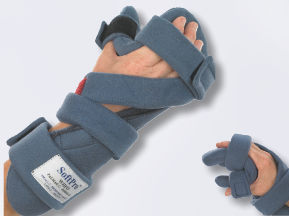
HCPCS L3807 L3809