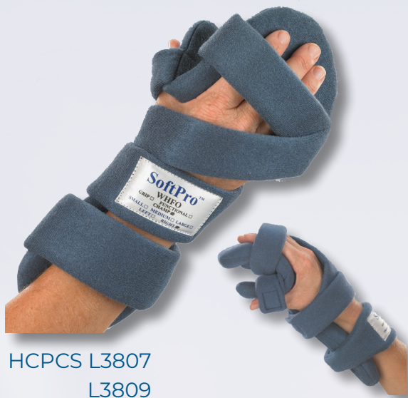
HCPCS L3807 L3809