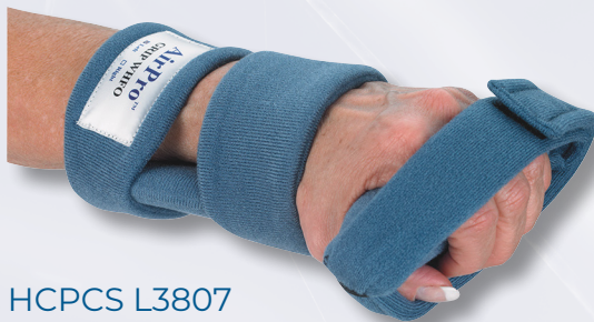
HCPCS L3807 L3809