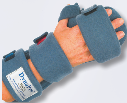
HCPCS L3807 L3809