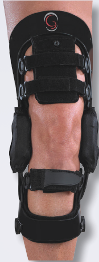
HCPCS L1845, L1852