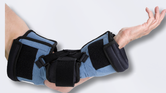
HCPCS L3760 L3761