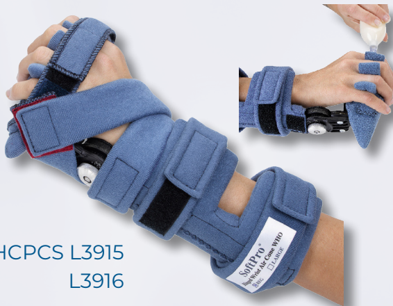
HCPCS L3915 L3916