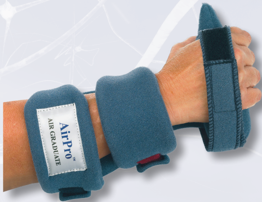
HCPCS L3807 L3809