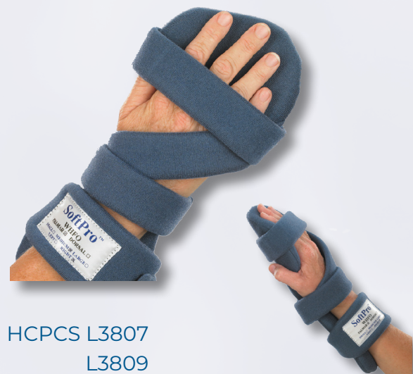
HCPCS L3807 L3809