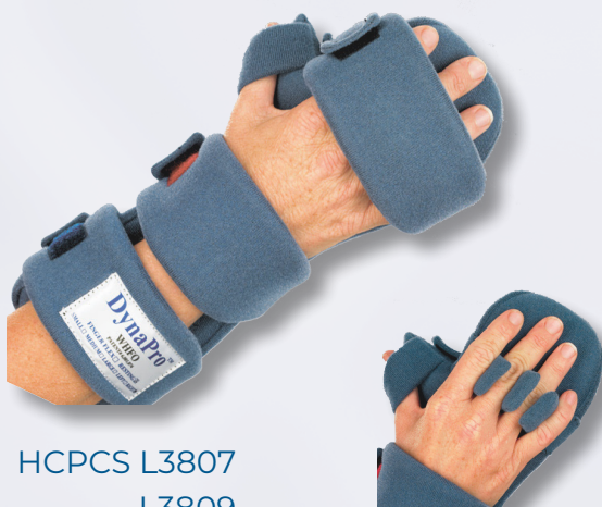
HCPCS L3807 L3809