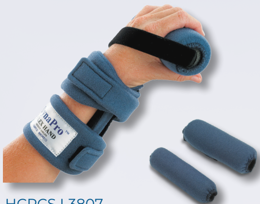
HCPCS L3807 L3809