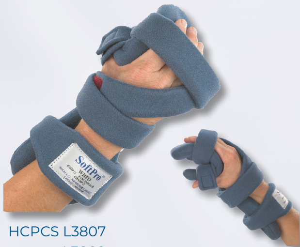
HCPCS L3807 L3809