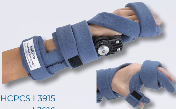
HCPCS L3915 L3916