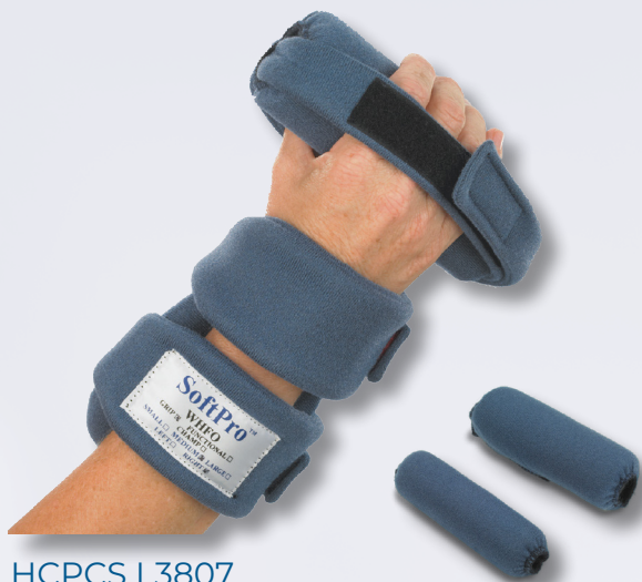
HCPCS L3807 L3809