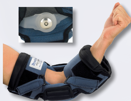
HCPCS L3760 L3761