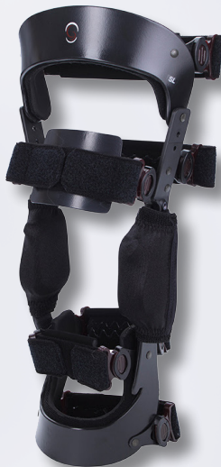
HCPCS L1832, L1833